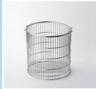
Single Basket 16/50L