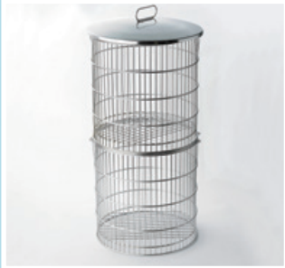
Double Baskets n/a for smaller upright models