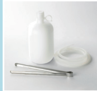
Water Bottle, Silicone Tube, Clips Stainless Steel Tube also available